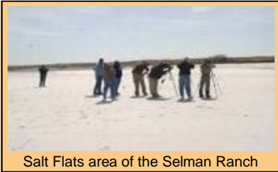
Salt Flats area of the Selman Ranch

A full-day devoted to the hot spots of Harper and Woodward Counties in northwestern Oklahoma. Stops will include Boiling Springs State Park, a wonderful hotspot for neotropical migrants and many other species. This is a scenic location with clear running springs and ancient cottonwood trees. Other stops include a privately owned spring-fed pond that, during even the driest years, holds water, a sure location for many species of shorebirds and waterfowl. Nearby playa lakes, —a critically imperiled form of wetland in the short/mixed grass prairie — provides a resting place for many birds which may include the White-faced Ibis,